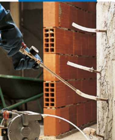
Injecting Epojet to a fissured pillar