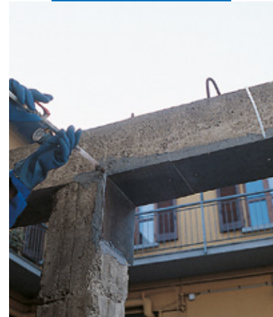
Repairing beam with injection of Epojet