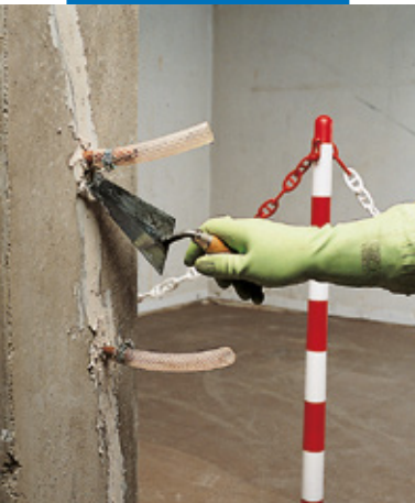
Fixing injection tubes with Adesilex PG1