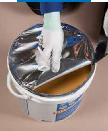
Easy and fast removal of the sealing film