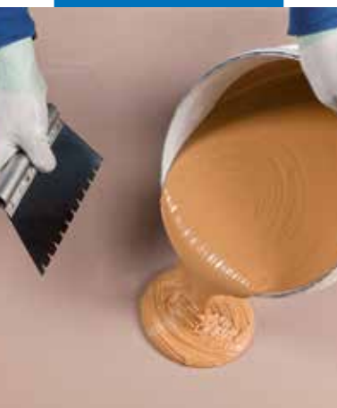
Excellent keeping and stability of the product