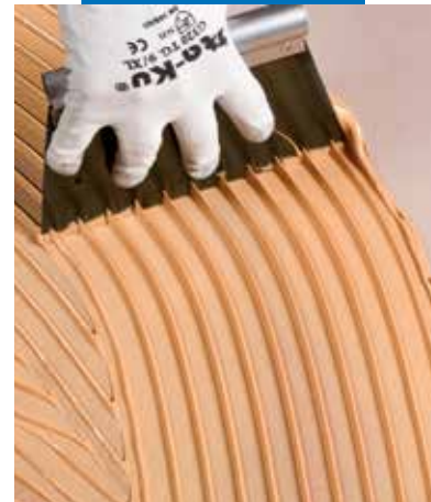
Excellent workability and rib stability

All relevant references for the product are available upon request and from www.mapei.com