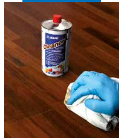
Cleaning large format of pre-finished parquet with Cleaner L