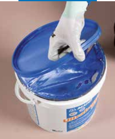
Easy opening of the bucket