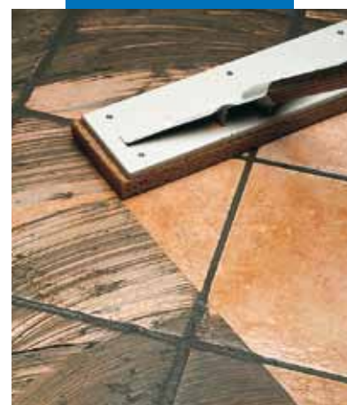
Cleaning a singles-fired tile floor with a sponge brush