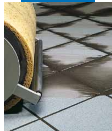
Floor finishing with a machine