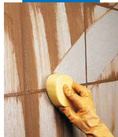
Wall finishing with a sponge