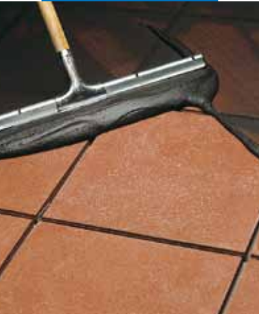
Grouting a terracotta tile floor with float