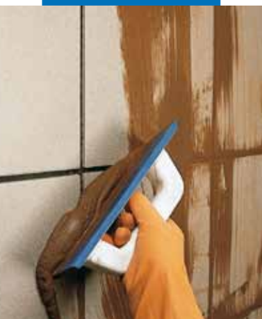
Grouting an external wall with a float