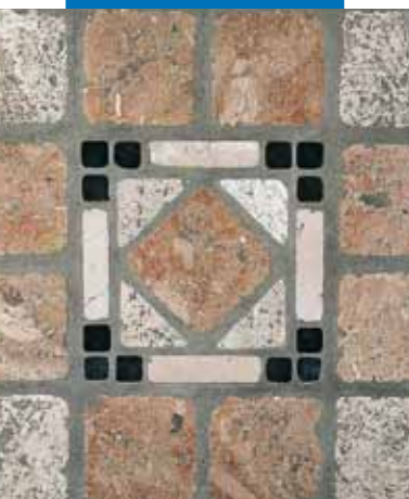
An example of a grouted antiqued marble stone floor