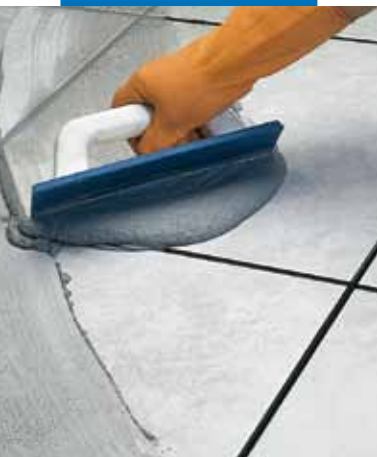
Grouting a ceramic tile floor with a sponge trowel