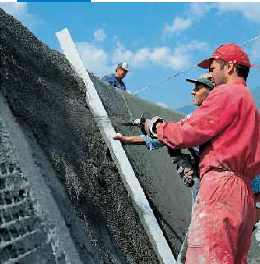
Spray application of Mapegrout T40