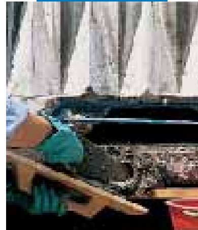
Repairing a balcony with Mapegrout T40