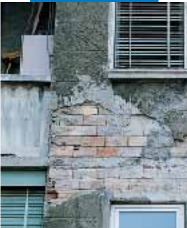
Degraded building façade in need of repair

After applying Mapegrout T40 , we recommend that it is cured carefully, especially in hot or windy weather, to avoid