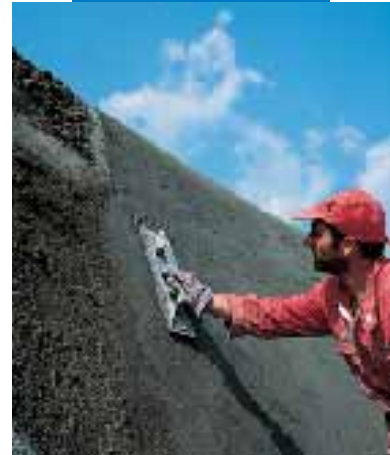
Finishing of Mapegrout T40